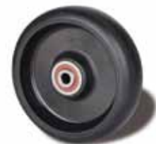
Neoprene Super Roll (SR)